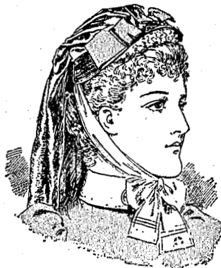
The "St. Bride's" Bonnet. Made of fine Straw with Lace and ruching, and trimmed with Ribbon, and long Silk Gossamer Fall. In black and colours, 12/6 each. Without Fall, 9/6; also The "St. Clare" Bonnet. 6/11 complete.